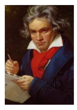
Portrait of Beethoven by Joseph Karl Stieler, 1820