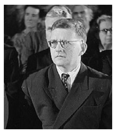
Shostakovich in 1956